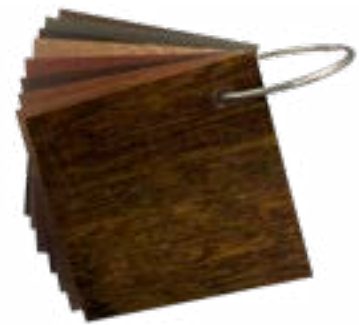
FiberCraft Color Sample Ring

Available Finish Samples —We have a Finish sample ring available. Please inquire for more information.